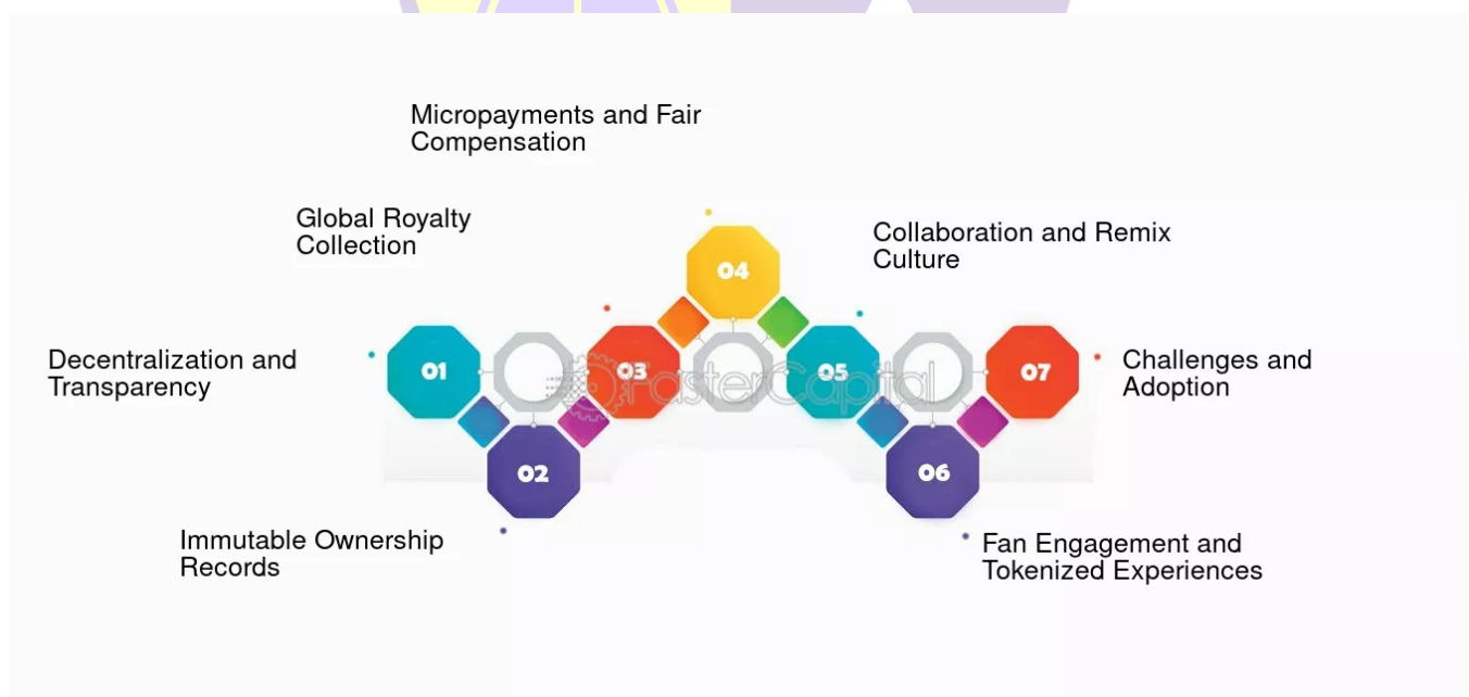
Fig.1 Exploring Blockchain Applications, Source([1])

The music and entertainment industries have faced persistent challenges in artist management and royalty tracking, including issues related to transparency, delays, and disputes over compensation. These challenges often arise due to the involvement of numerous intermediaries, opacity in royalty calculations, and the manual processes currently in place. Blockchain technology, with its decentralized, transparent, and immutable nature, has emerged as a potential solution to address these systemic issues. By integrating blockchain into artist management and royalty tracking systems, it becomes possible to create a more efficient, transparent, and equitable distribution of royalties and intellectual property rights. This paper explores the applications of blockchain technology in enhancing transparency, ensuring accurate royalty distribution, and streamlining administrative processes in the music industry.