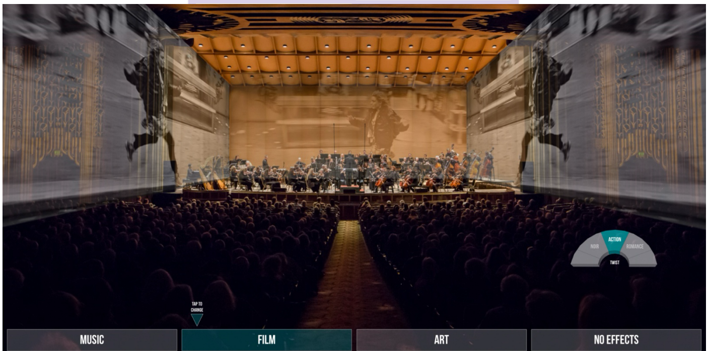
Fig.1 Impact of Augmented Reality on Experiential Music, Source([1])

Augmented Reality (AR) has profoundly transformed various industries, with entertainment and music performances being no exception. This manuscript delves into the impact of AR on experiential music performance, focusing on how it reshapes audience engagement, performer creativity, and the overall concert experience. By integrating virtual elements into live music, AR offers a new dimension of interaction and immersion, where both the audio and visual aspects of a performance are synchronized in real-time. Through an extensive review of literature, an empirical methodology, and a detailed simulation study, this paper evaluates the potential of AR in enhancing the live music experience.