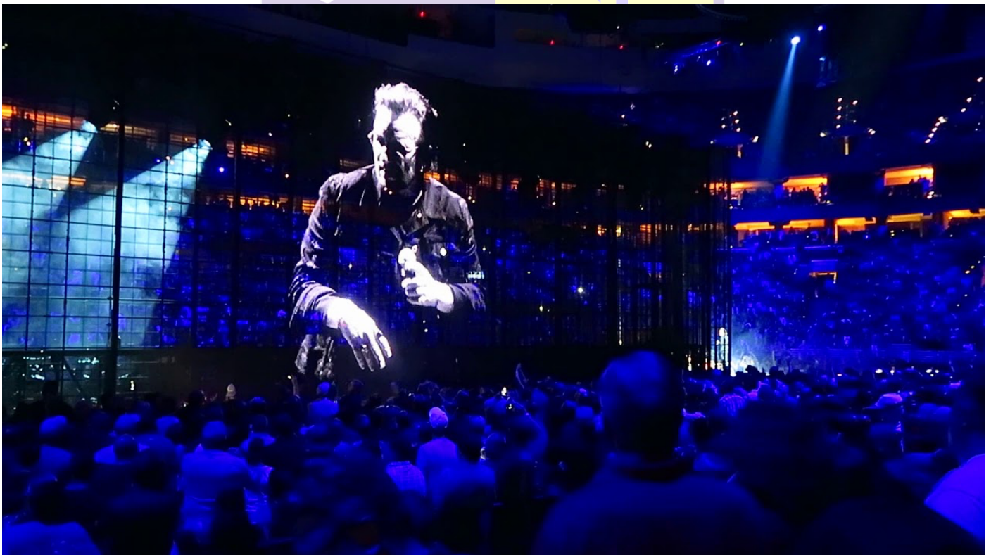
Fig.2 Music Festival

The introduction of Augmented Reality (AR) into live performances is revolutionizing the music industry, offering artists new ways to connect with their audiences. AR technology overlays digital elements onto the physical world, creating interactive and immersive experiences that enhance the emotional depth of live performances. As AR technologies continue to evolve, they present an exciting opportunity to transform traditional concert experiences. With the ability to project 3D visuals, manipulate environments in real-time, and engage the audience directly through their devices, AR enhances the sensory experience for both performers and spectators alike. For musicians, AR introduces new forms of creative expression, allowing them to interact with virtual elements and even influence the performance itself through gestures and movements.