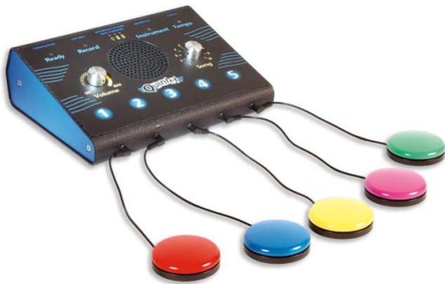
Fig.1 Assistive Technologies in Digital Music Education

harmony, and tempo, providing students with a richer and more immersive learning experience.